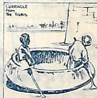
THE CORACLE. Is also a very primitive type of boat and was used amongst fishermen in the remoter parts of Wales and Ireland. The type illustrated, which needs two men to paddle it, shows the skin covered wickerwork frame. The latter is made of palm fibres interwoven on a wicker frame and is water-proofed with bitumen.

Did errands for Mum. FA Amateur cup. Extra Preliminary Round.